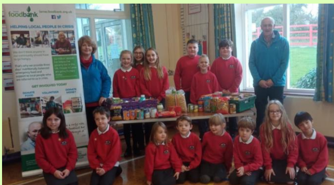
Cairncastle Primary School

Larne Foodbank volunteers receive donations from local schools who have helped provide food and toiletries. Thank you to all who have donated items.