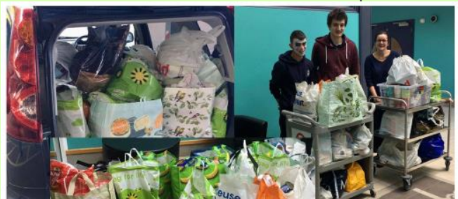
Roddensvale Special School

Larne Foodbank volunteers receive donations from local schools who have helped provide food and toiletries. Thank you to all who have donated items.